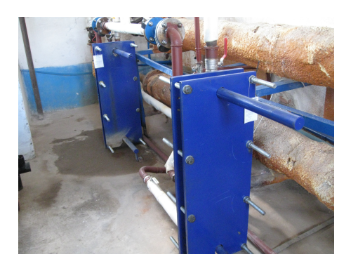
Fig. 1 New heat exchangers

Improvement of the heat networks system organization is provided by liquidation of Central Heating Points (CHP) with replacing 4-pipe lines by 2-pipe ones with simultaneous installation of heat exchangers directly at the consumers (Individual Heating Point - IHP), or reconstruction of CHP with modern heat exchangers installation. It is enable to liquidate of pipes with different diameters, to reduce heat losses and to reduce power circulation consumption for power supply of pumps. Technical characteristic of new heat exchangers (see fig. 1) are presented on the producer's website http://teploenergo.com.ua