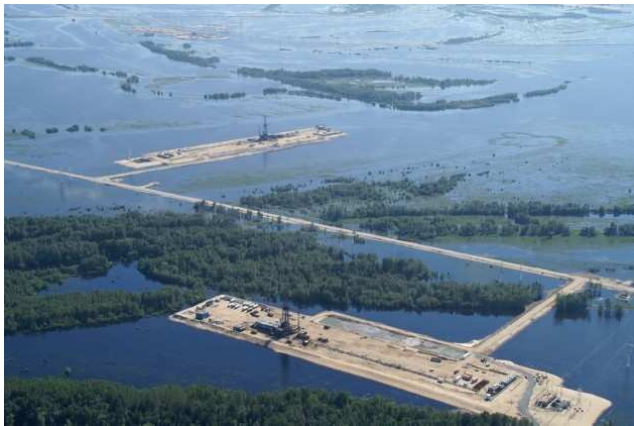
Figure A.4.1.4.1 Infrastructure of RN-Uganskneftegas at Priobskoe oil field.

Sixty percent of the territory of Priobskoe oil field is occupied by Ob river floodplain, which poses special requirements for construction of well clusters, pressure piping and underwater sections of pipelines.