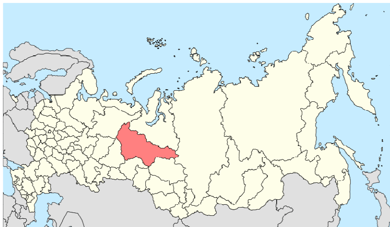
Figure A.4.1.2-1. Khanty-Mansiisky Autonomous District on the map of the Russian Federation

Khanty-Mansiisky Autonomous District is the subject of the Russian Federation with population 1,538,600 people (2010) and area 534,800 km 2 ; it is the historic dwelling of small indigenous folks of Khanty and Mansi. There are 106 municipalities in this district. The town of Khanty-Mansiisk is the administrative capital of the district.