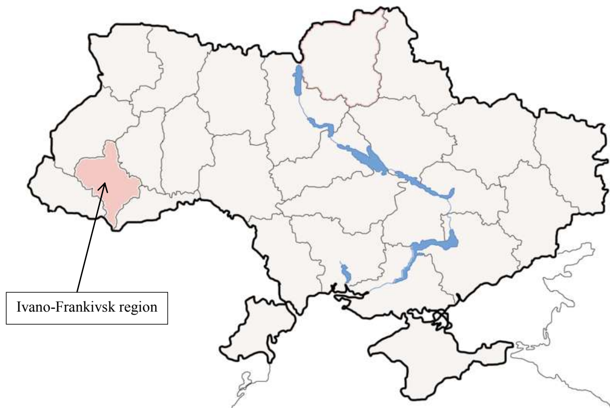
Figure 1. The map of Ukraine with indication of Ivano-Frankivsk region

The Project is located in the territory of Ukraine's Ivano-Frankivsk (Ivano-Frankivsk region) and the territories adherent to the city (Figure 1).