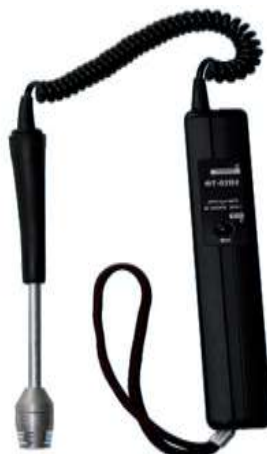
Figure 2. A photo of FT-02V1 leak detector.

Specifications of FT-02V1 leak detector are provided in Table 1.