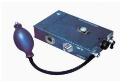
Figure 2. MI-11 interferometer mine.

MI-11 interferometer mine. In order to detect methane leaks in a sample MI-11 leak detector, shown in Figure 2, is used.