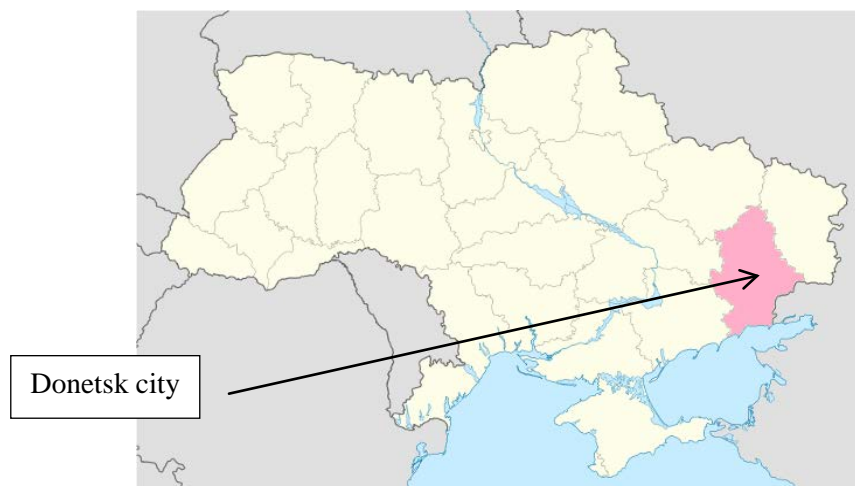
Figure 1. Map of Ukraine with the indication of Donetsk city.

The project is located in the territory of Donetsk city, Ukraine and territories adherent to the city (Figure 1).