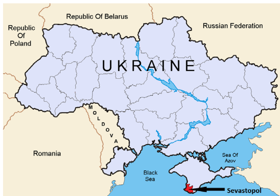
Figure 1. The map of Ukraine with indication of Sevastopol

The Project is located in the territory of Ukraine's Sevastopol and the territories adherent to the city (Figure 1).