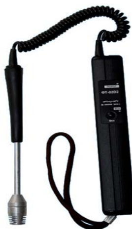
Figure 2. A photo of FP-12 leak detector.

FP-12 leak detector. In order to detect methane leaks in a sample FP-12 leak detector, shown in Figure 3, is used.