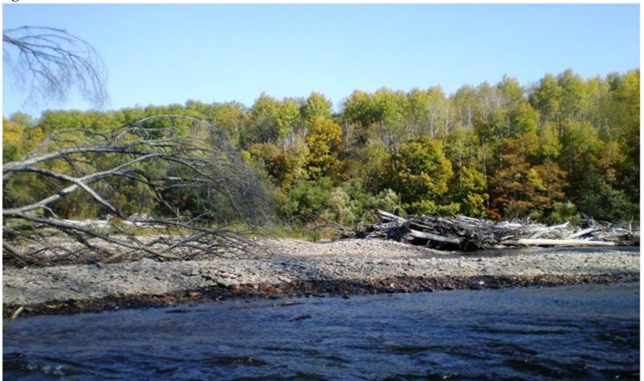
Figure 1: River bank on Bikin River