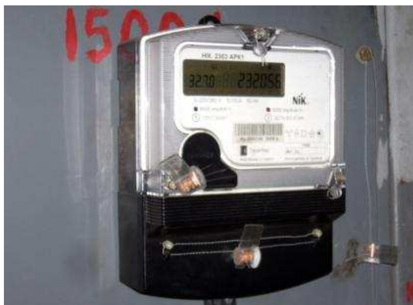
Figure 4 Electricity meter NIK2303ARK1