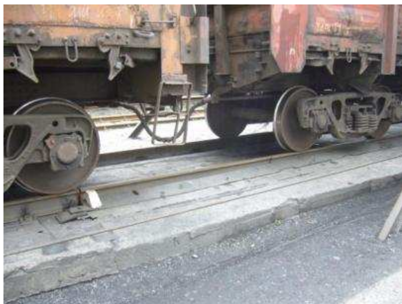
Figure 1 Railroad Scales DS150t