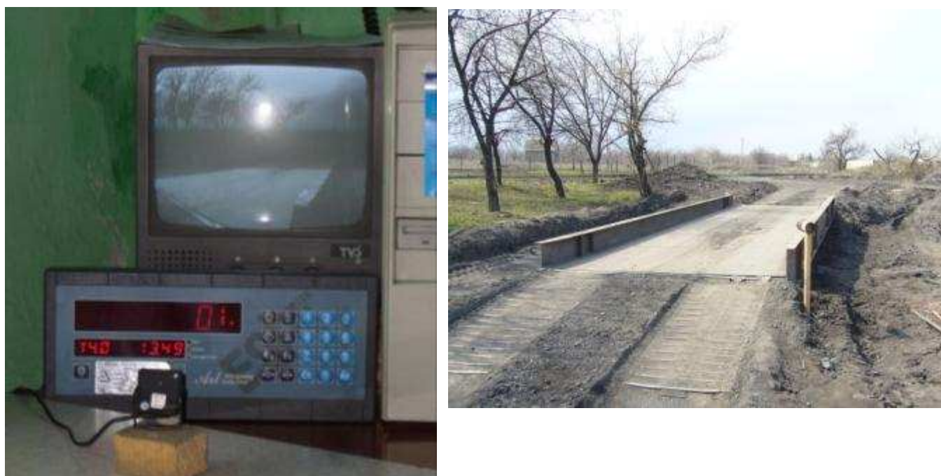
Figure 3 Automobile