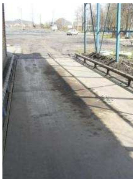
Figure 2 Automobile scales “Kokchetau”