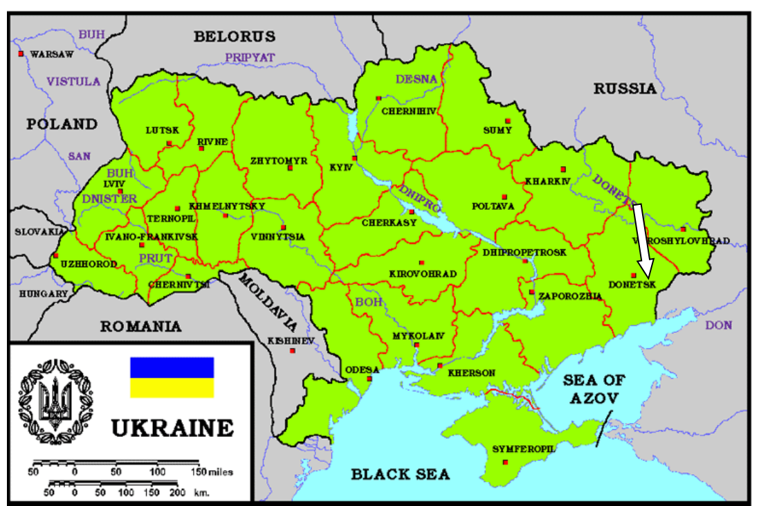
Reconstruction of Units1,2,3 and 4 at Zuyevska Thermal Power Plant page 4