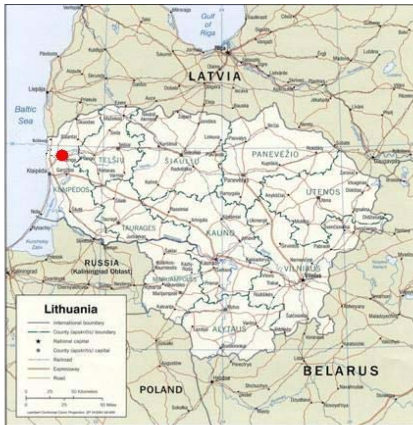
Figure 1. Location of the project

Rudaiciai wind power park project has been constructed in western part of Lithuania, Kretinga district, near villages of Kiauleikiai, Kveciai and Rudaiciai. The location of the project is presented in Figure 1: