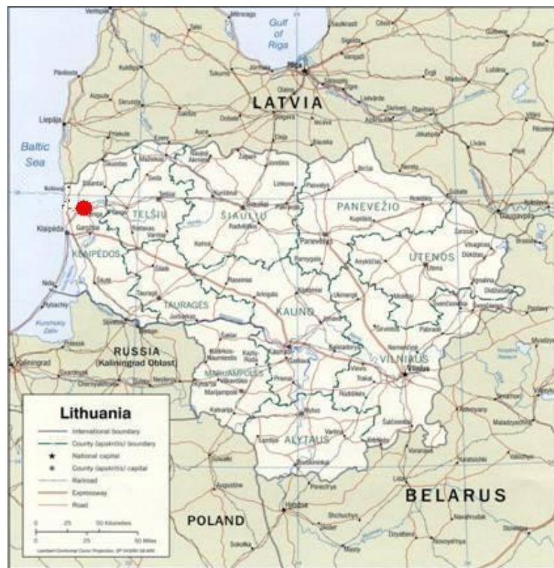
Figure 1 Location of the project

Rudaiciai Wind Power Park has been constructed in western part of Lithuania, Kretinga district, near villages of Kiauleikiai, Kveciai and Rudaiciai. The location of the park is presented in Figure 1: