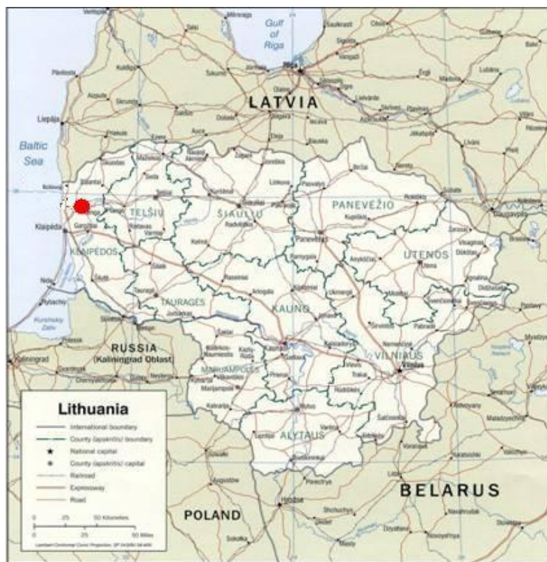
Figure 1. Location of Benaiciai Wind Power Project

The project generates electricity and supplies it to the national grid. The project reduces greenhouse gas emissions by partially substituting power production in other power plants in Lithuania that run on fossil fuel. The project also reduces emissions of other pollutants arising from burning of fossil fuel, such as SO 2 and NO x . In addition, implementation of this project helps promoting renewable energy resources and stimulates their use.