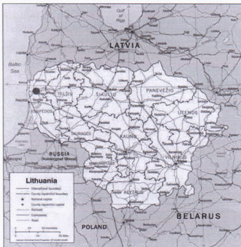
Figure 1. Location of Benaiciai Wind Power Park

The project generates electricity and supplies it to the national grid. The project reduces greenhouse gas emissions by partially substituting power production in other power plants in Lithuania that run on fossil fuel. The project also reduces emissions of other pollutants arising from burning of fossil fuel, such as SO 2 and NO x . In addition, implementation of this project helps promoting renewable energy resources and stimulates their use.