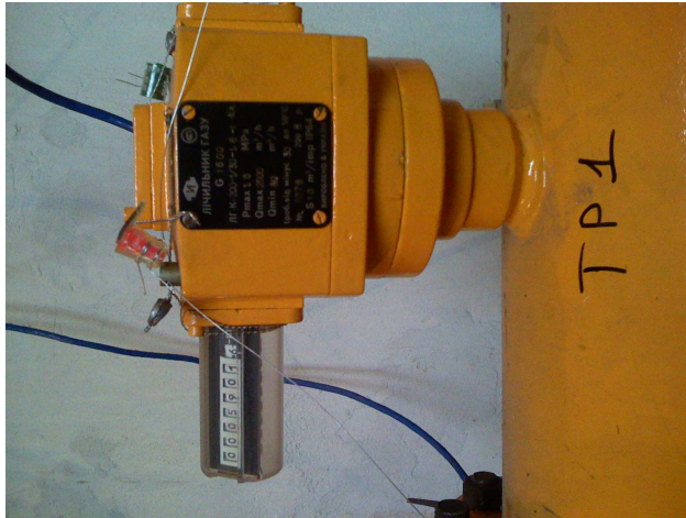
Fig. 2. Gas flow meter

The typical scheme of the Gas distributing system is shown at the fig. 3. Usually it consists of the following equipment: