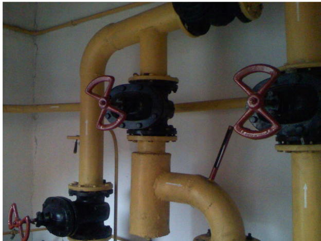
Fig. 1. Gas distribution unit

The control and monitoring system comes to fuel consumption measurement. Other parameters are defined by calculations or taken from statistic data. Fuel consumption measurement is realized at the Gas distributing units of the boiler-houses. Gas registration is caring out in volume units relate to standard conditions by means of automatic correction for temperature and pressure. The typical Gas distribution unit is shown at the fig. 1, typical Gas flow meter is shown at the fig. 2.